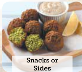
Snacks or Sides