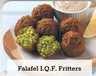
Falafel I.Q.F. Fritters

Customize by adding your own ingredients and style