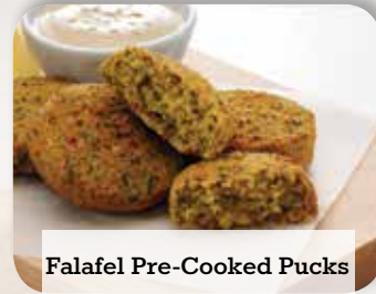
Falafel Pre-Cooked Pucks