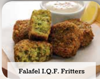
Falafel I.Q.F. Fritters

Customize by adding your own ingredients and style