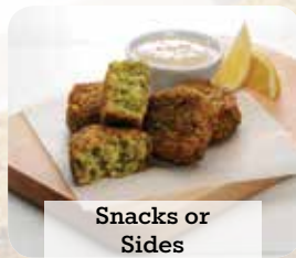
Snacks or Sides